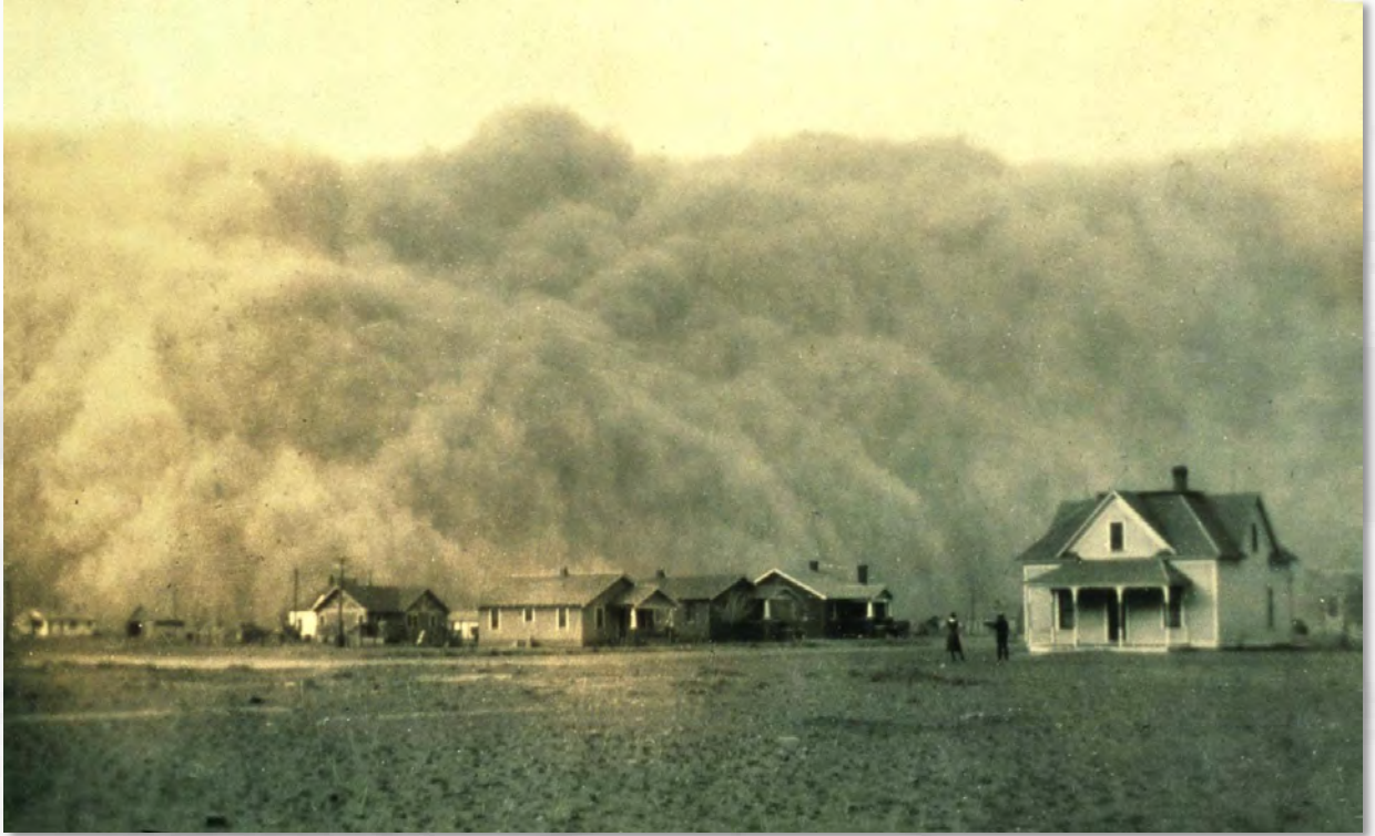
Dust storm approaching Stratford, Texas, April 1935.