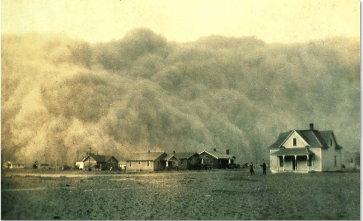
Dust storm approaching Stratford, Texas, April 1935.